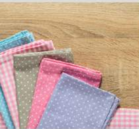
TABLE CLOTH Polyester